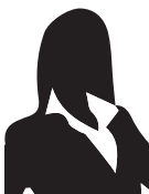
Sarah Low Community College, Qatar