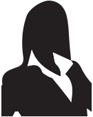
Sarah Low Community College, Qatar